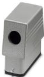
HEAVYCON sleeve housing D25, for single locking latch, height 72 mm, without support 1x M25, lateral conductor exit

Please be informed that the data shown in this PDF Document is generated from our Online Catalog. Please find the complete data in the user's documentation. Our General Terms of Use for Downloads are valid ( http://phoenixcontact.com/download )