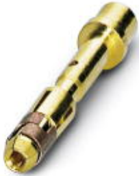
Crimp contact, turned, Single contact, Contact diameter: 1 mm, Crimp range: 0.25 mm 2 ...1 mm 2

Please be informed that the data shown in this PDF Document is generated from our Online Catalog. Please find the complete data in the user's documentation. Our General Terms of Use for Downloads are valid ( http://download.phoenixcontact.com )